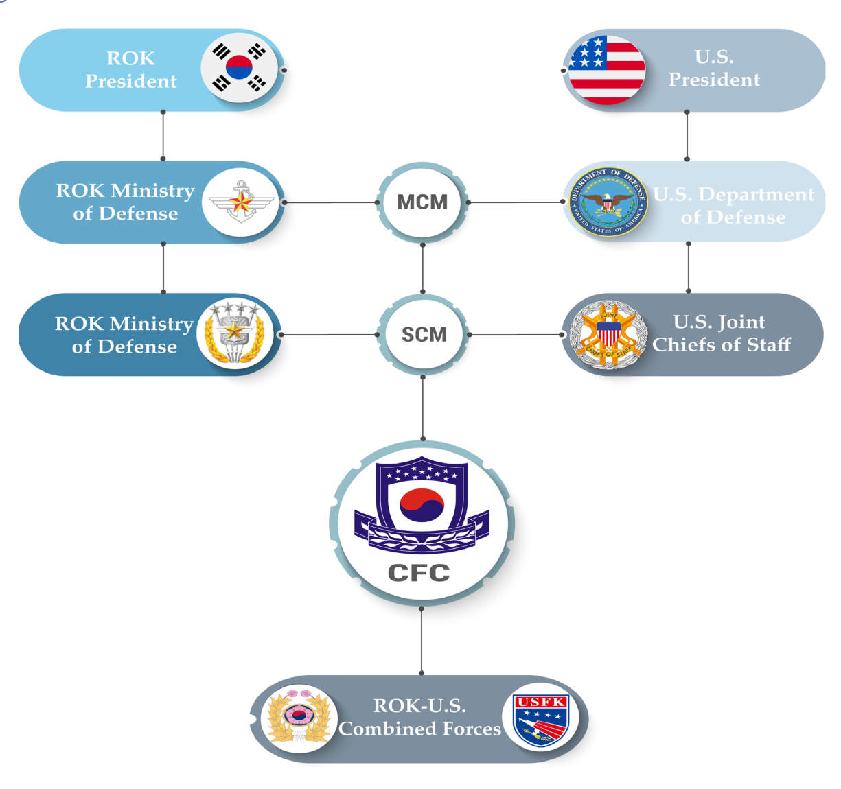
Figure 3. ROK-U.S. Command Structure<sup>8</sup>

The CFC introduced a more cooperative and equal system of OPCON over the ROKA. This unique bi-national command system is structured as a bi-manned chain of command: "If the chief of a staff section is Korean, the deputy is American and vice versa", beginning at the very top where the CGCFC is a four-star U.S. Army General and his deputy a four-star ROKA General.