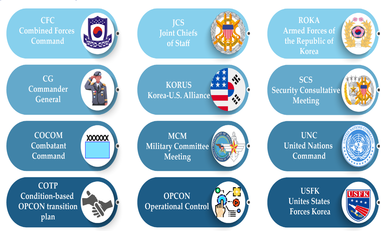
Figure 1. Glossary of Abbreviations

Korea alliance more co-equal, was above all a diplomatic gesture by the United States. Under Armistice conditions, military training, maintenance, and equipping procedures are under Seoul's control. Only when war is declared, and only with the approval of the respective presidents of South Korea and the United States, is OPCON of designated Armed Forces of the Republic of Korea (ROKA) units to be transferred back to the Combined Forces Command (CFC.)