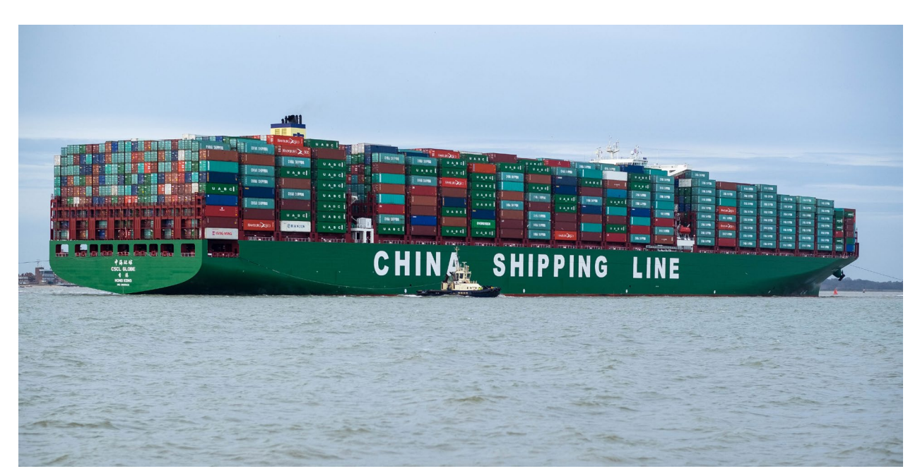
Figure 4: The CSCL Globe- one of several container ships built for trade between China and Europe

Security remains a critical concern for the success of the Belt and Road Initiative. Both segments pose numerous contrasting security challenges whilst SOEs may make these problems worse.