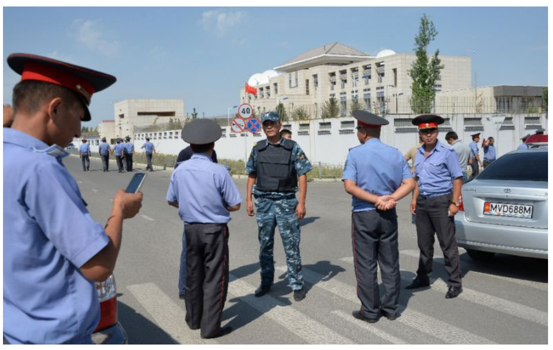
Figure 3: Aftermath from the bombing of China's Kyrgyzstan embassy

Indeed, "China has yet to craft a complete system of laws and regulations for companies to regulate fair conduct or disclosure regarding overseas investment are limited and fragmented."<sup>23</sup> The track-record of Chinese SOEs in Africa is exemplary of these problems.<sup>24</sup> Further, the Belt and Road Initiative has been touted as a solution to China's