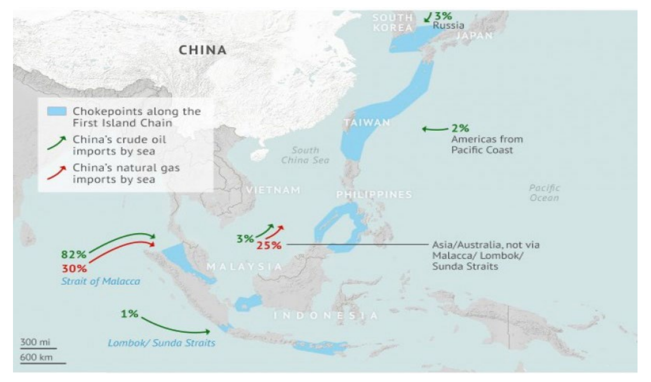
Figure 1: Map of China's Import Transit Routes and Maritime Chokepoints

Geopolitical realities have also helped shape the Belt and Road initiative. Over time China has undoubtedly become more active on the world stage. The initiative gives China a tremendous opportunity to raise its profile by taking on significant financial risks.<sup>7</sup> Further, the large-scale infrastructure projects and foreign investment that will occur under the initiative may give Beijing a greater say in world affairs. Indeed, neighboring economies will become more close-