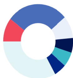
Figure 3: Financial Contribution to UN Peacekeeping Budget

and reconciliation government, which ended Cambodia's internal conflict that began after Vietnam's removal of the Khmer Rouge regime. Its involvement in the East Timor UN mission from January 2000 onwards, where it sent its first active civilian police officers, marked a shift in the willingness of the Chinese to engage more proactively in peacekeeping operations.