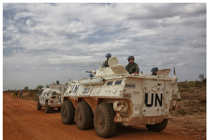
Figure 1: Chinese UN Peacekeepers in South Sudan

Peacekeeping contributions have, however, steadily become an important part of China's soft power strategy, allowing Beijing to advance its interests abroad while fostering collaboration with other nations, as it undergoes its so-called "peaceful rise". By engaging in peacekeeping operations – and by extension non-violent intervention and recourse to diplomacy – Beijing is attempting to balance out the perception of China as a threat. A significant increase in peacekeeping contributions took place in 2003 and 2004, which coincides both with its rising prominence as an economic power and the U.S. invasion of Iraq. There-