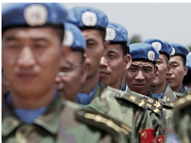
Figure 5: Chinese Peacekeeping Personnel

In January 2016, Beijing played an instrumental role in brokering a cease fire agreement between the South Sudanese government and reb-