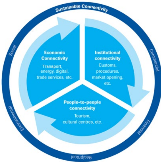
Figure 2. Connectivity's three pillars