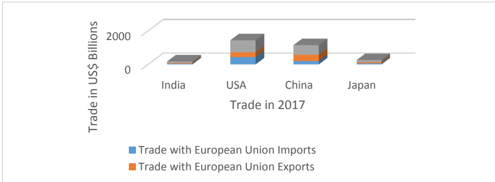
Figure 1. Major powers' trade with EU