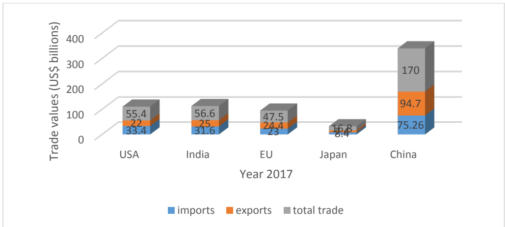
Figure 4. Major powers' trade with Africa

Currently, Africa is a preferred continent for investment and has strong economic ties to many countries such as China, Japan, India and some European countries. AAGC's prime intent is to forge an intercontinental growth and developmental corridor, establishing a chain of contacts between Asia and Africa. The EU is seeking a "partnership of equals" with Africa. Its relationship approach towards Africa has mostly been politically motivated, keeping its self-interest ahead. But its stance on critical issues such as migration, human rights, security and terrorism has been severely criticized in Africa. The EU, however, seems determined to change this narrative, stressing on development and engagement with Africa. Its official approach to Africa embraces AAGC's norms and values. Figure 4 presents various countries' trade figures with the African continent.