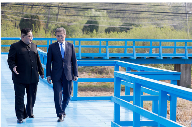
Figure 4: Leaders Chairman Kim Jong Un and President Moon Jae-in outside the Cheongwadae - Blue House during the historic inter-Korean summit.