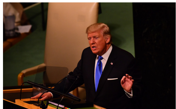
Figure 3: Donald Trump speaks at the UN General Assembly in September 2017

Tensions dramatically receded in 2018, however, leading to a flurry of bilateral summit diplomacy and new declarations pledging complete denuclearization of the Korean Peninsula and a new future for U.S.-North Korea and inter-Korean relations. It remains to be seen if this is genuinely a new era or not. Looking back over nearly three decades, there have been patterns of conflict escalation followed by de-escalation and resumption of negotiations. But while these have served to slow or delay North Korea's nuclear development, they have not entirely stopped or reversed it.