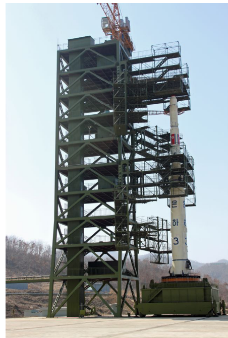
Figure 2: North Korean Unha-3 rocket at launch pad

With the failure of the 2012 deal, the Obama administration pursued a policy known as “strategic patience,” which essentially waited for North Korea to change while maintaining diplomatic and economic pressure. 21