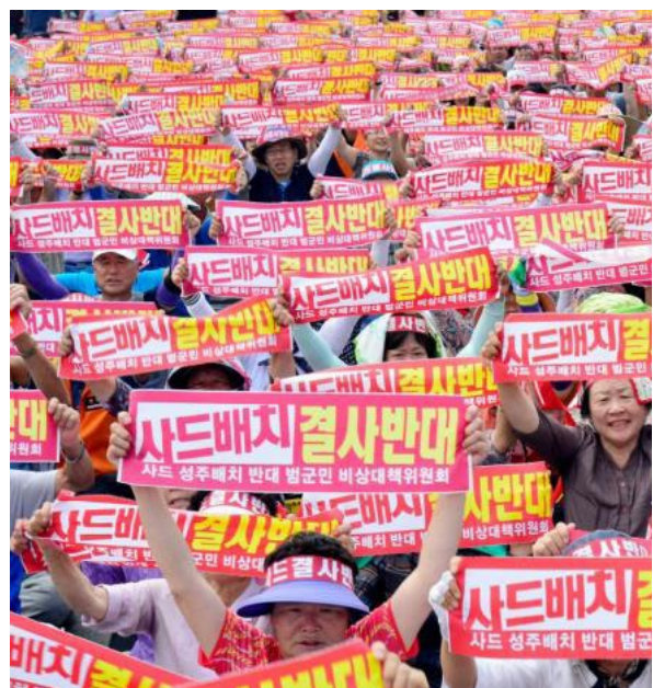
Figure 3: Seongju residents protest against THAAD

Following President Park’s impeachment in a corruption scandal, THAAD became a central issue in presidential elections held in May 2017. The subsequent winner, Moon Jae-in