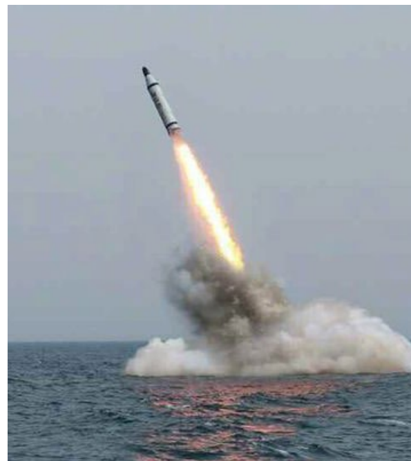
Figure 2: 2015 North Korean SLBM Test

The U.S. has proposed the deployment of THAAD in South Korea since 2014. Official discussions started in early February 2016, largely as a result of North Korea's fourth nuclear test conducted a month earlier. After a series of consultations, the decision to deploy THAAD was made public by the Park Geun-hye administration on July 7, 2016. According to a joint statement between the U.S.