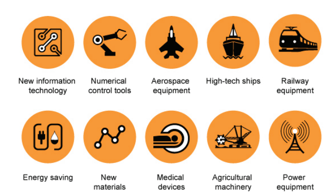
Figure 1: The key sectors that will benefit from MIC 2025

where the technology that is difficult to replicate via reverse engineering. Smart manufacturing involves combining the internet with wireless sensors and robotics to improve its manufacturing efficiency, quality, and productivity. If successful, China would move up the value-added chain, repositioning itself from a low-cost manufacturer to a direct competitor to nations like South Korea, Japan, and Germany.