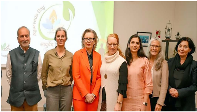
Sources: @IndiainSweden, November 10; Ayurveda Sweden, November 10; ETV_Bharat, November 9

As the WHO Global Centre on Traditional Medicine takes shape, this celebration marks a pivotal moment in recognizing and bridging the gap between conventional and traditional healthcare, fostering openness, respect, and trust. Ayurveda Day stands as a beacon, promoting the integration of 5000-year-old medical practices, paving the way for a more inclusive and comprehensive approach to global healthcare.